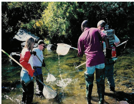
Environmental Health, University of Massachusetts Lowell