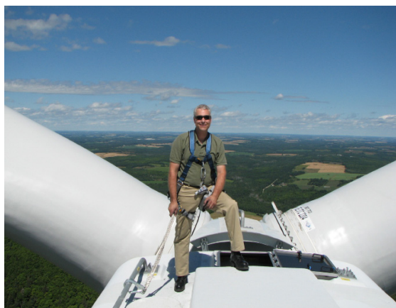
Wind Power Technology, Northern Maine Community College

of the New England Regional Student Program