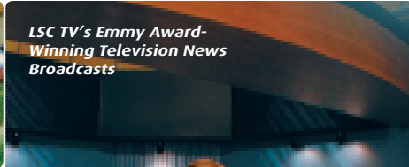
LSC TV's Emmy Award-Winning Television News Broadcasts